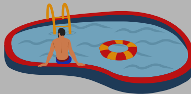
Swimming (pools and hot tubs)