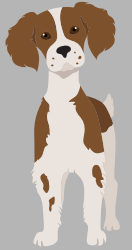
Contact with Infected Animals †