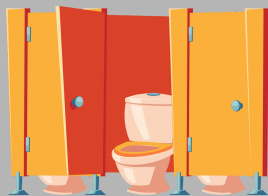
Using Public Restroom Facilities