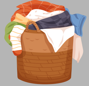
Contaminated Linen (bedding, towels, clothes, etc.)