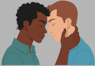
Other Intimate Contact * (hugging, kissing, cuddling, massaging, etc.)