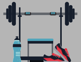
Working Out at the Gym