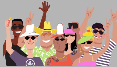
Attending Crowded In-Door Events with People who are Not Fully-Clothed